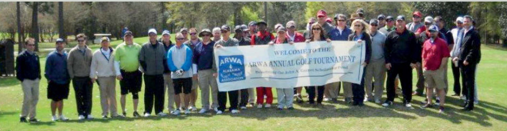
Participants of the ARWA 19th Annual Golf Tournament gather for a picture just before the Shotgun Start.