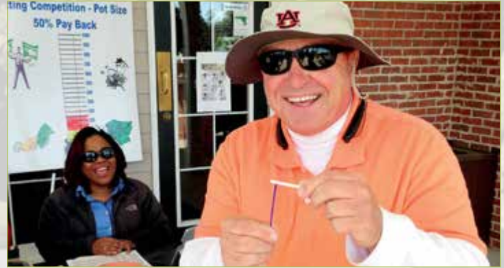
ARWA staff welcomes golfers as they register